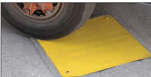
Flexible, non-absorbing bottom layer is reinforced with tear-resistant mesh