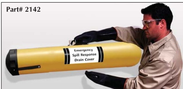
Optional Ultra-Drain Seal Wall Mount Units allow quick response to any spill — just “grab and go”!