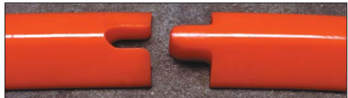
Interlocking end joints help create longer lengths and are self-sealing.